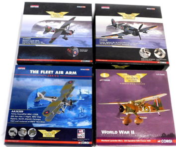
Corgi The Aviation Archive diecast planes, boxed. (4)SOLD for £100