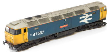
A kit built O gauge Class 47 locomotive Gordon Davies, 47587, BR blue with yellow ends. SOLD for £140