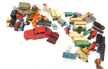
Diecast and tinplate vehicles, to include Matchbox Merryweather Fire Engine, Dinky buses, Dinky trains, a Chad Valley Harborne tinplate clockwork car, etc. (2 trays) SOLD for £160