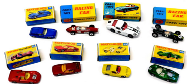
Corgi and Matchbox diecast cars, boxed. (8) SOLD for £100