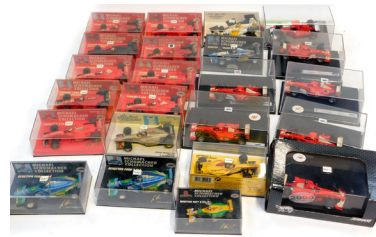
Minichamps Michael Schumacher Collection and Ralph Schumacher Collection F1 cars, including Ferrari F300, Ferrari F310, Ferrari 1997 Launch Edition, Ferrari F310/2, Benetton Ford B194, Jordan Peugeot 197 Ralph Schumacher, etc. (1 box) SOLD for £300