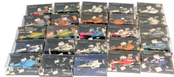
Paul's Model Art by Minichamps diecast F1 vehicles, (1 tray) SOLD for £320