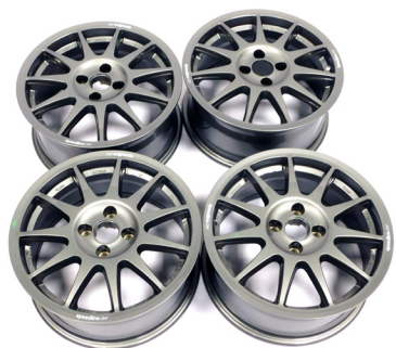
A set of four Speed Line Corse AISi7Mg alloy wheels. SOLD for £220