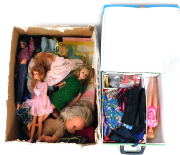
The World of Barbie doll's case, various Barbie and Sindy dolls, etc. (1 box) SOLD for £140