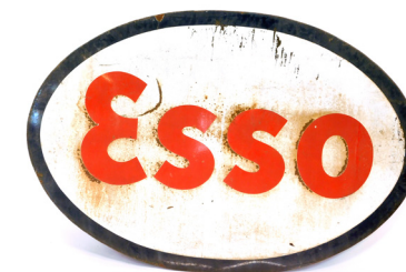
An enamel ESSO advertising sign, the blue enamel border with white ground with red writing, 150cm x 103cm. (AF) SOLD for £280