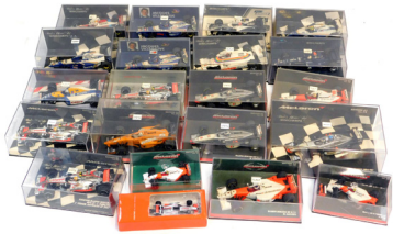
Paul's Model Art by Minichamps F1 diecast vehicles, (1 tray) SOLD for £220