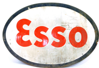
An enamel ESSO advertising sign, the blue enamel border with white ground with red writing, 150cm x 103cm. (AF) SOLD for £320