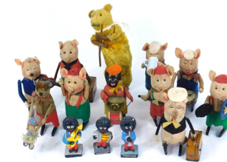
1930s Disney Three Little Pigs clockwork toys, and other clockwork toys, together with three Robertsons figures. (a quantity) SOLD for £420