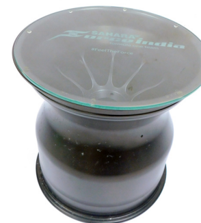
A Sahara Orceindia Formula 1 Team F1 alloy side table, with circular glass top, on an 88S RE1533 alloy, 37cm high, 35cm diameter. SOLD for £200