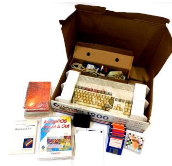
A Commodore Amiga 1200, boxed. SOLD for £220