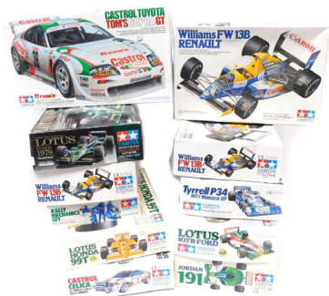
Tamiya F1 and other race car model kits, including a Castrol Toyota Tom's Supra GT, Lotus type 79 1979 Martini, Williams FW13B Renault, Tyrrell P34 1977 Monaco GP, Lotus 107B Ford, Jordan 191, Lotus Honda 99T, etc. (11) SOLD for £280