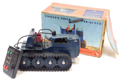
A V-Models Vickers Vigor remote control track laying tractor, boxed. SOLD for £300