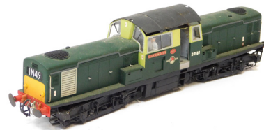
A kit built O gauge Class 17 Bo-Bo locomotive, Councillor Ann Davies nameplate, D8568, BR green. SOLD for £120