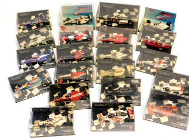
Paul's Model Art Minichamps diecast F1 cars, (1 tray) SOLD for £220