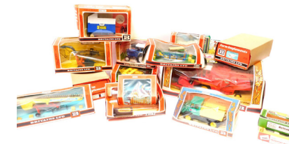
Britains model diecast, including 9570 Massey Ferguson combine harvester, 9564 elevator, 9542 Forage harvester, 9569 Unimog tractor lorry, etc., boxed. (2 trays) SOLD for £320