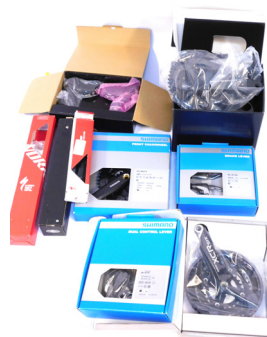
A group of bicycle accessories, to include Shimano brake levers, Suntour XCR chain set, Shimano Ultegra chain set, etc., boxed. (1 box) SOLD for £150