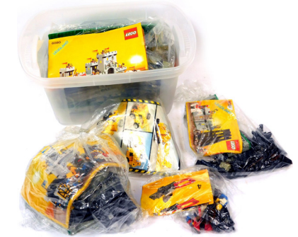
LEGO sets, including 6080 Kings Castle, 6061 Siege Tower, etc. (1 box) SOLD for £140