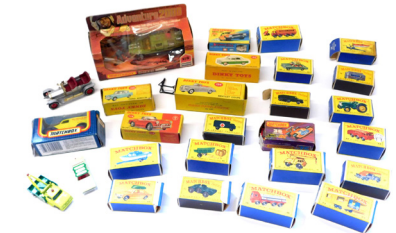
A collection of boxed Dinky and Matchbox cars, (1 box). SOLD for £300