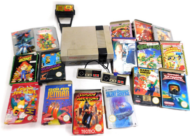
A Nintendo Entertainment system NS version, with controllers, game genie and boxed games (1 box) SOLD for £280