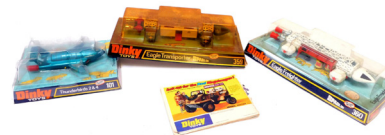
Dinky Toys diecast, including 101 Thunderbirds 2 and 4, Space 1999 359 Eagle transporter, and Space 1999 360 Eagle freighter, boxed. (3) SOLD for £120