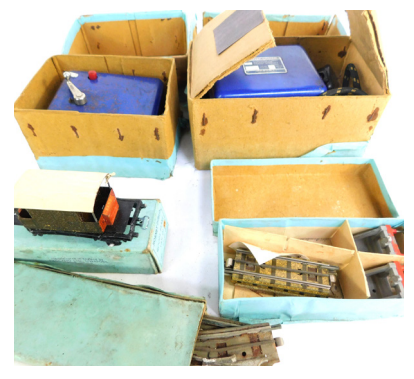
A group of Hornby Dublo OO gauge tin plate accessories, rolling stock, track, petrol tank wagon Power Ethyl, brake van D, oil tank wagon Royal Daylight, another, signals, corridor coach D1, etc., mainly boxed. (a quantity) SOLD for £480