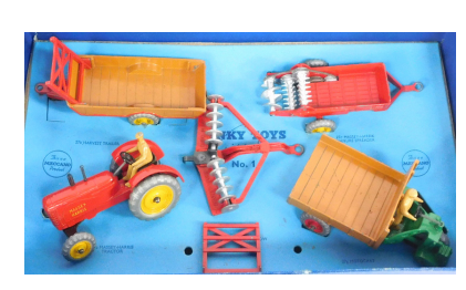
A Dinky Toys Farm Gear gift set, to include tractor and other accessories, partially boxed. SOLD for £120