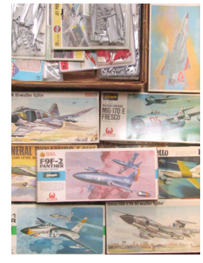
Revell 1:72 aeroplane kits, to include US Navy fighter, Phantom F-4K/M, Frog 1:72 scale and others, etc., boxed. (a quantity) SOLD for £120