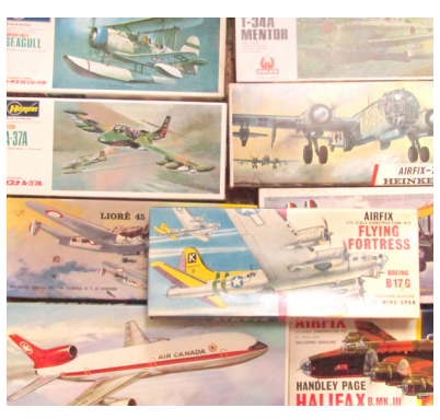
Heller and other 1:72 scale aeroplanes, to include Hasegawa Cessna A-37A, various others, boxed. (a quantity) SOLD for £240