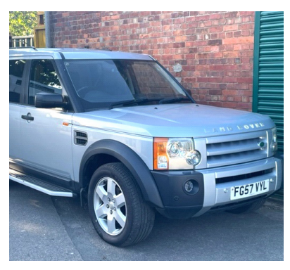
A Land Rover Discovery TDV6 HSE, Registration FG57 VYL, first registered 29th September 2007, current mileage 147,211, diesel, automatic, silver, V5 present, one key, comprehensive service history, last serviced at 141,000 miles, new belt fitted at 91,000 miles. SOLD for £3,000