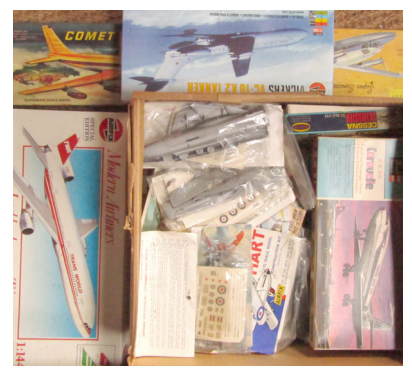
Revell and other aeroplane kits, to include SE210 Caravelle aeroplane, Frog 1:72 lightning fighter, various other plastic Airfix aeroplanes, pieces, Airfix Avro Anso 1/76 scale aeroplane, etc., boxed. (a quantity) SOLD for £130