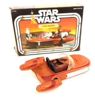
A Star Wars Kenner Land Speeder, 1977 copyright. (boxed) SOLD for £150