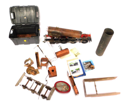
A 51/2" Thompson B1 locomotive, partially built, to include boiler, tender chassis, brass water pick up dome, together with an incomplete 51/2" gauge boiler, water tank, and boiler tube. (a quantity) SOLD for £300