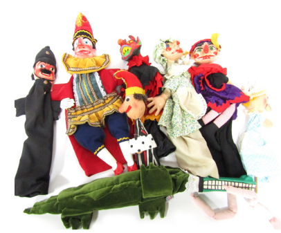
A Good modern set of punch and Judy papier mache puppets, to include Mr Punch, Demon, Policeman, some with material faces. (a quantity) SOLD for £240