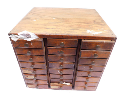
A wooden apprentice tool chest, with three rows of single drawers, containing a quantity of automobile screws and parts, 30cm high, 34cm wide, 33cm deep.