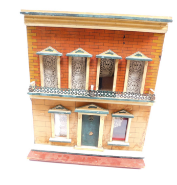
A mid 20thC Georgian style dolls house, with fixed roof, open windows, and fixed door, and a small quantity of accessories, 60cm high. SOLD for £300