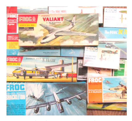
Frog and other aeroplane kits, Avro Shackleton, 1:72 scale Messerschmitt, etc., boxed. (a quantity) SOLD for £220