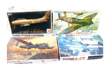
Four Hasegawa Deluxe model aeroplanes, to include F-86F Sabre Airfix-24 Spitfire 1A pattern 1201, boxed. (4) SOLD for £120