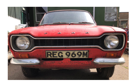
A barn/garage find Ford Escort Sport 1300, Registration REG 969M, first registered 14th May 1974, odometer reading of 75,680 miles, last tax disc for 2003, no paperwork. SOLD for £15,000