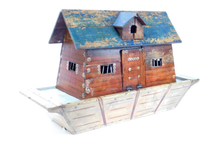
A late 19thC Continental Noahs Ark, including Noah, two kneeling figures and ten animals. SOLD for £200