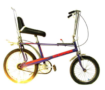
A Raleigh MkII Chopper bike, arrow wedge, purple, with Sturmey Archer gears, serial number NG4020899, Nottingham, May 1974. SOLD for £550