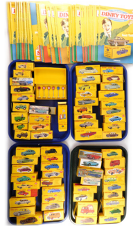
Deagostini Dinky Toys classic car collection magazines, and Dinky toys including Ford Cabrolet Thunderbird 203 Peugeot, Packard 8 Sudan, Citroen DS19, Renault mini cab, Austin convertible, Volvo 122S, Renault R8 police, etc. (a quantity) SOLD for £170