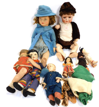
A group of ceramic, felt and other dolls, including a Chad Valley felt doll in a blue dress and hat, two Chad Valley Hygienic Toys felt dolls in embrace, bisque head doll, clothing, shoes, etc. (1 box) SOLD for £280