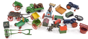
Dinky & Britains die cast farm vehicles and implements, including Dinky Toys moto cart, horse and plough, etc. (1 tray) SOLD for £120