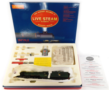
A Hornby OO gauge Live Steam class A3 locomotive 'Papyrus', 4-6-2 60096, BR lined green, R2492, boxed. SOLD for £550