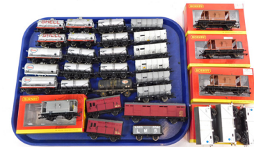
Hornby OO gauge rolling stock, including mineral wagons, tank wagons, brake vans, blue spot fish vans and CCT vans. (1 tray) SOLD for £130