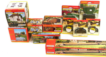
Hornby Skaledale OO gauge buildings, including R8654 Lock Keeper's Cottage, R8655 Lockside Stores, R8647 Lock Chamber, bridge adapters, bridge ramp adapters, R8651 lower lock adaptor and R8569 Canal Bridge, boxed. (10) SOLD for £140