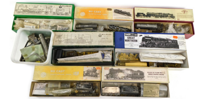
Various OO gauge metal kit build locomotive kits, including LNER P2, Pro scale LNER Peppercorn class A1, Nu-Cast, etc. (1 tray) SOLD for £160