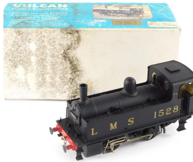
A Vulcan O gauge 1528 class 0-4-0 tank locomotive, LMS black, boxed. SOLD for £130