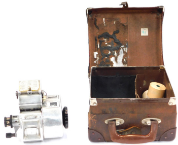
A London Transport Company Gibson A14 Route 22 bus ticket machine, serial no 29135, boxed, with reels. SOLD for £360