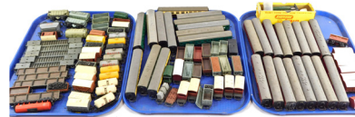
Tri-ang T gauge coaches and rolling stock, including mineral wagons, grain wagons, con flats, tankers, etc. (4 trays) SOLD for £150