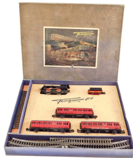
A Fleischmann HO gauge train set, comprising an 0-4-0 locomotive and tender, three coaches and track, boxed. SOLD for £280