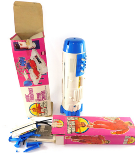
The Six Million Dollar Man, Steve Austin figure and the Bionic transport and repair station. (3) SOLD for £120