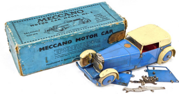
A Meccano clockwork tin plate M247 saloon coupe, boxed (AF) SOLD for £500