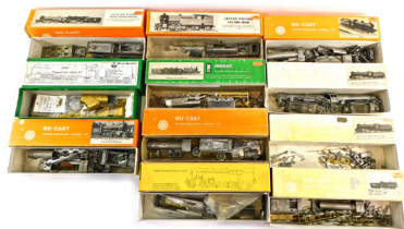
A group of OO gauge brass and white metal locomotive kits, including Pro Scale LNER Peppercorn Class A1, seven Nu-Cast engines to include LNER/BR V1 V3 Class 262 tank engine, ABS models LNER L12-6-4T Class L1, etc. (1 tray) SOLD for £480