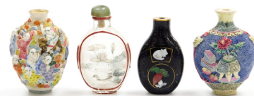
Two Chinese porcelain relief decorated snuff bottles, with Qianlong marks (AF), 7.5cm high, together with a glass snuff bottle, the interior painted with a duck, etc., and a cloisonné bottle decorated with cats, (4). SOLD for £340