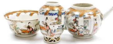
An 18thC Chinese teapot with matching bowl and teacup, hand-painted with figures on a terrace and with gold hatched wave-like borders, teapot lacking lid, vase 10cm high, bowl 12cm diameter, teapot 8.5cm high. SOLD for £500