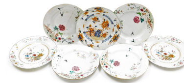
A collection of 18th Chinese plates, including four matching famille rose with chrysanthemum and swallow decoration, 23cm diameter, a pair with flowers and vases, 23cm diameter, and a Chinese Imari plate, 22.8cm diameter. SOLD for £240