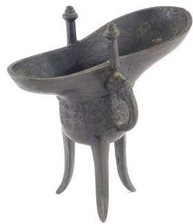
A Chinese bronze tripod libation cup of archaic form, with a geometric band and rectangular inscription tablet, 16.5cm high. SOLD for £200