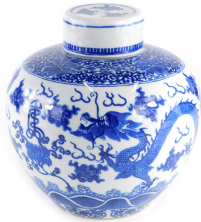
A 19thC Chinese porcelain ginger jar and cover, decorated in underglaze blue with a band of scrolls, peonies above clouds, flowers and four-toed dragons, four character Yongzheng mark, 22.5cm high, 22.5cm wide. SOLD for £600