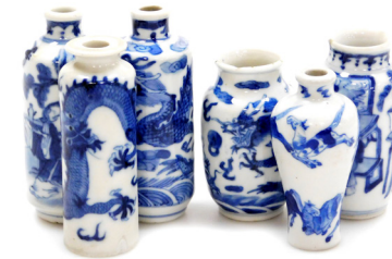
Three Chinese blue and white cylindrical porcelain snuff bottles, decorated with dragons, figures in a landscape, another of meiping form decorated with horses, and two further miniature blue and white vases; various Yongzheng and Qianlong marks to the undersides of five, ranging from 5.8cm high to 7.8cm high. SOLD for £1,200