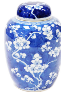
A Chinese blue and white porcelain ginger jar and cover, decorated with prunus blossom on a cracked ice ground, four character Kangxi mark to base, 21.5cm high. SOLD for £220