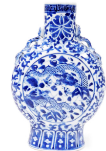
A 19thC Chinese blue and white moon flask, the circular body decorated with flowers and panel depicting two dragons to the front and reverse, with dragon handles, on an oval foot with Greek key fret decoration to the top, 21.5cm high. SOLD for £240