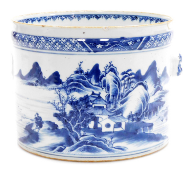
A 19thC Chinese blue and white porcelain wine cooler, decorated with pavilions in landscape, lacking one mask handle, 21cm diameter. (AF) SOLD for £240