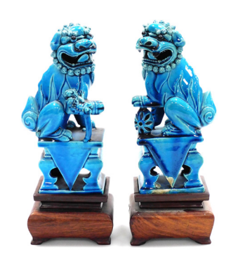
A pair of Chinese turquoise pottery glazed figures of Buddhistic lions, on square bases with hardwood stands, 28cm high overall. SOLD for £360