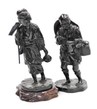
A pair of Japanese Meiji period bronze Tokyo School figures, of a lady holding a hoe and teapot, and man with pipe and tobacco pouch, four character signature of Genryusai Seiya to each base, each figure 26cm high, one hardwood base.