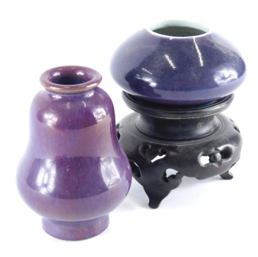
Two purple glazed vases, the darker of squat circular form, the other being pear shaped, 11cm diameter and 11cm high. (2) SOLD for £1,000