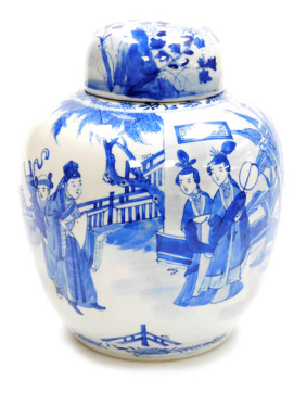
A Chinese porcelain blue and white jar and cover, the body decorated with figures in garden, with matched cover, four character Kangxi mark to underside, 19thC, 28cm high. SOLD for £750