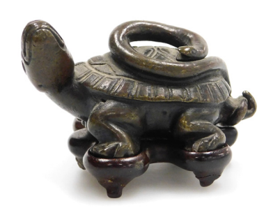
A Chinese bronze turtle, with snake on its back, on a carved hardwood base, the turtle 7cm wide. SOLD for £300