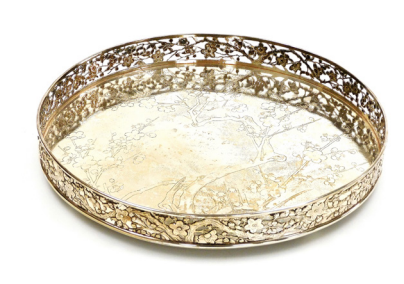
A Chinese silver circular tray, the centre finely engraved with prunus blossom, the pierced gallery also decorated with the same motif, the base marked Luen Wo decoration, 27.5cm diameter. SOLD for £700