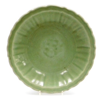
A Chinese celadon dish, with incised decoration within a wave border, probably 18thC, 32cm wide. SOLD for £500