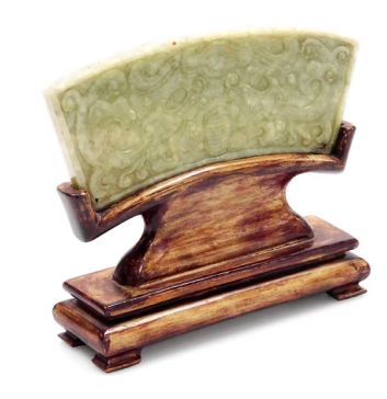
A Chinese carved jade plaque, carved ub klow relief with archaic designs, on a hardwood stand, 11.5cm high overall. SOLD for £950