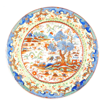
An 18thC Chinese blue and white porcelain charger, later clobbered with a riverscape and dragons, within a blue diaper and floral border against a pale green ground, pseudo seal mark, 55cm diameter. SOLD for £300