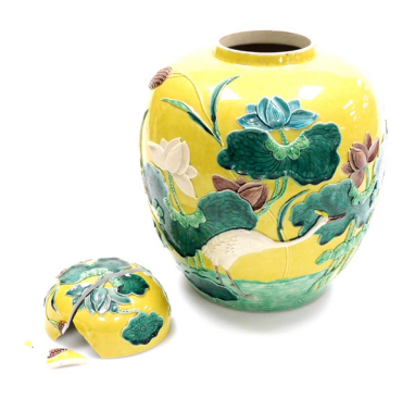
An early 20thC Chinese porcelain ginger jar, decorated in relief with stork and water lillies, on a yellow ground, with four character mark Wang Binrong to underside, the vase 24cm high. (the lid AF) SOLD for £400