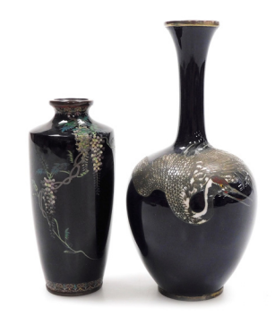
A Japanese Meiji period cloisonne bottle vase, with a slender neck, decorated with a stork, 12.5cm high, and another blue cloisonne vase, decorated with hanging wisteria, 8.5cm high. SOLD for £260