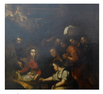
18th/19thC Continental School, The Adoration of the Shepherds after Peter Paul Rubens, oil on canvas, 102cm x 84cm. SOLD for £650