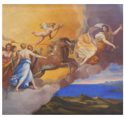
Late 19thC Continental School. A Neo-Classical scene with figures, a chariot and a cherub with flaming torch over head, oil on canvas, 63cm x 99cm.