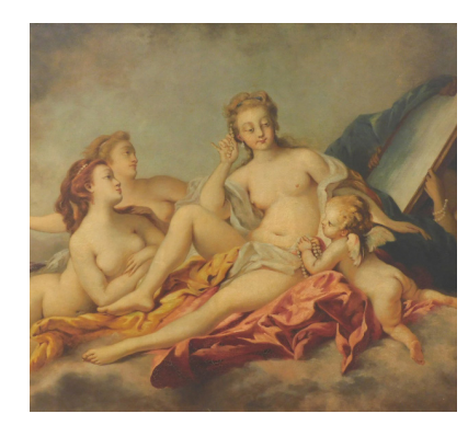
Late 19thC Continental School. Venus with reclining muses and a cherub, oil on canvas, 80cm x 97cm. SOLD for £480