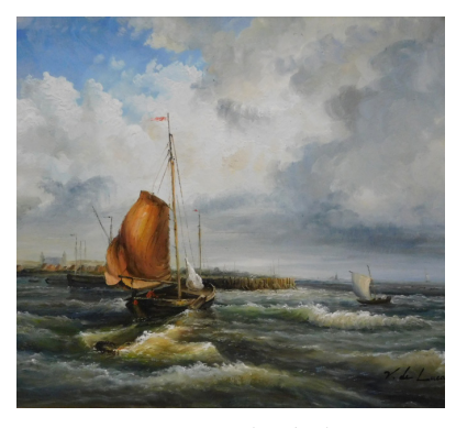
Vincentio De Luca (20thC). Boats on rough seas, oil on board, signed, 29cm x 42cm and another similar. - a pair. (2) SOLD for £440