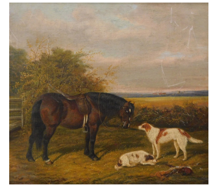
19thC English School. Horse and dogs in a paddock with houses in the distance, oil on canvas, unsigned, probably by the same hand as lot 1072, 30cm x 39cm. SOLD for £200