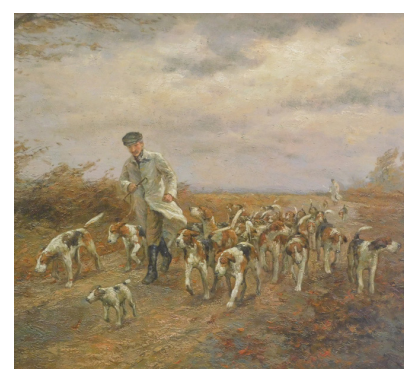
Harris (20thC). Fox hounds with huntsmen on foot in a windy autumnal landscape, oil on canvas, signed, 71cm x 104cm. SOLD for £440