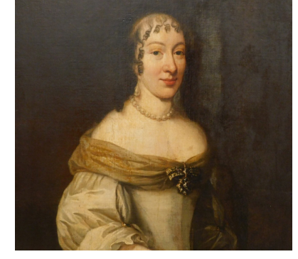
17th/18thC follower of Sir Peter Lely. Portrait of a lady half length, with ringlets and wearing a pearl necklace, holding a fan, oil on canvas, 89cm x 69cm. SOLD for £1,300