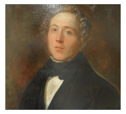
19thC English School. Portrait of a gentleman, quarter profile, wearing jacket, tie and watch chain, oil on stiff canvas, unsigned, 79cm x 62cm. SOLD for £220