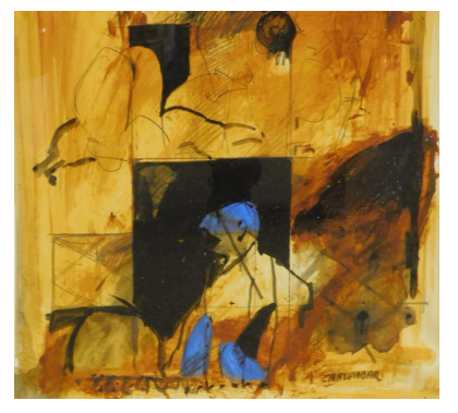
Chittonveanu Mazumdar (b.1956). Paris, France, post-structural scene, acrylic on paper, signed, 60cm x 53cm. SOLD for £700