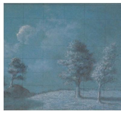
Algernon Newton. Twilight scene, trees, mixed media, 10cm x 15cm. Label verso. We are advised this is a preparatory drawing for Downland Landscape, September 1961. SOLD for £2,150