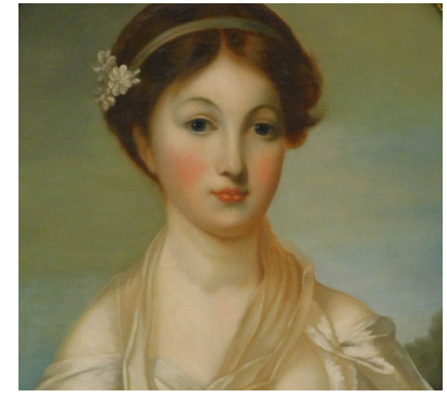
19thC English School. Portrait of a lady, quarter profile wearing flowing robe, oil on canvas, unsigned, 68cm x 50cm. SOLD for £340