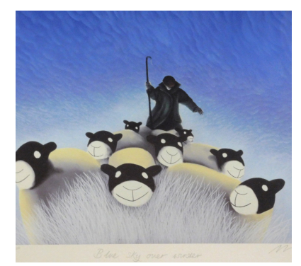
Mackenzie Thorpe (b.1956). Blue Sky Over Winter, artist signed limited edition lithograph, A139/200, 35cm x 45cm, with certificate. SOLD for £110