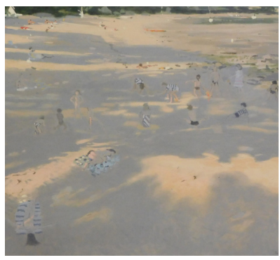
Andrew T. Macara (b.1944). Beach scene with figures, oil on canvas, signed and dated 1984, 70cm x 136cm. SOLD for £650