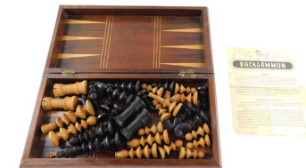
A late 19thC style turned wooden chess set, queen 89mm high, King 125mm high, contained within a stained yew wood and boxwood lined inlaid fold over chess board with internal backgammon board, 38cm wide, 37cm deep. SOLD for £380