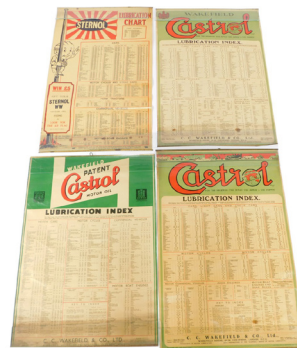
A Castrol Lubrication index poster, two further, and a Sternal lubrication chart. (4) SOLD for £460