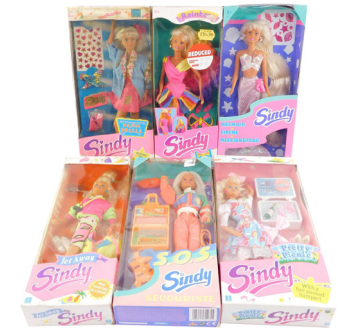
Six Sindy dolls, boxed, comprising, Jet Away, Rainbow, SOS, Denim Dazzle, Mermaid, and Pretty Picnic. (6) SOLD for £190