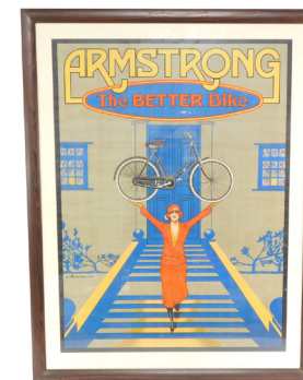
An Armstrong advertising poster The Better Bike, showing a lady holding aloft a lady's bicycle, 95cm high, 70cm wide. SOLD for £400