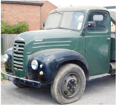
A 1955 Ford Thames SWB lorry, registration VSV 489, twin axle historic vehicle with boarded flat bed, green, first or re-register date March 1986 after restoration project, odometer reading 8,664, tax expired 1st April 1997, with V5 present. SOLD for £6,300