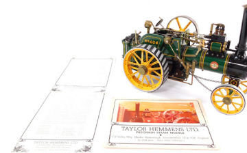
A William Allchin 3/4inch scale model traction engine, being a copy of a 1906 agricultural engine, number 634, scale 1/16, with details, for Taylor Ehemmens Limited, Market Harborough. SOLD for £900