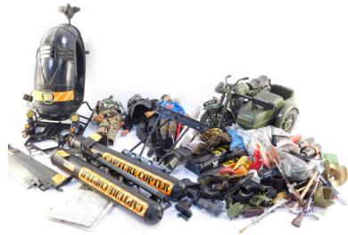
An Action Man Transport Command single seater helicopter, military motorbike and side car, figures and accessories. (a quantity) SOLD for £180