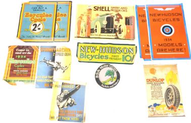
Early 20thC posters, to include Shell, Hercules Cycles., New Hudson Bicycles., and Sturmeys Archer, etc. (10) SOLD for £550