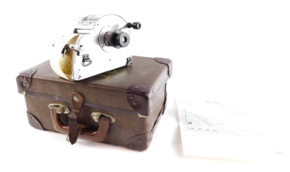
A London Transport Gibson A14 bus ticket machine, no.31001, calibrated for route 266, Brent Cross to Hammersmith, cased. SOLD for £340