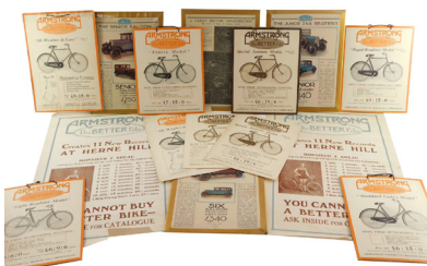
Six Armstrong For Better Bike advertising cards, together with model sheets, Singer advertising strut frames for the company, Senior Saloon, Six Saloon and Junior 2 and 4 seaters and two Armstrong advertising posters. (a quantity) SOLD for £380