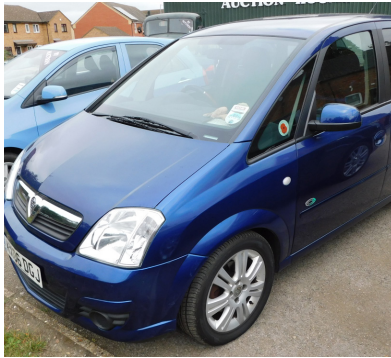
A Vauxhall Meriva, registration KX06 DGJ, 067,598 recd mileage, diesel, blue, first registered 18th July 2006, MOT expired 18th July 2019. To be sold upon instructions of the Executors. SOLD for £460