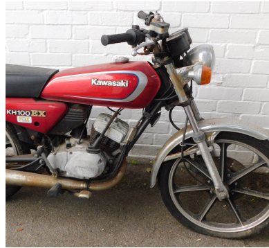
A Kawasaki KH100EX motorcycle, registration NRC73W, mileage on clock 471.2miles. SOLD for £850