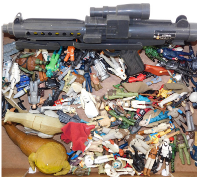
Assorted Star Wars figures, and a Star Wars gun. (a quantity) SOLD for £750