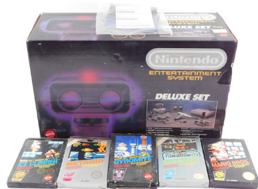
A Nintendo entertainment system, deluxe set, boxed, together with five games, comprising Metroid, Gyromite, Mario Bros, Rad Racer and Ice Climber. SOLD for £420