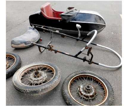
A motorcycle sidecar, together with three wheels, two for the bike, one for the sidecar, and a mudguard. SOLD for £400