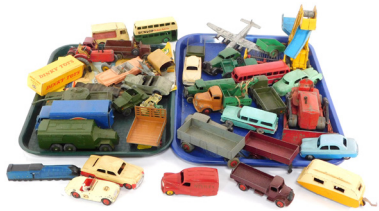
Dinky die cast, military, and agricultural, including an elevator loader., Mercedes 190SL, 24H., Lagonda., Motorcart., and a caravan, together with Dinky Toys and Super Toys catalogues. (2 trays) SOLD for £240