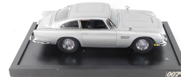
An Eagle Moss Ltd kit built model of James Bond's 007 Aston Martin DB5, scale 1:8, assembled, with display stand, and protective car covers. SOLD for £420