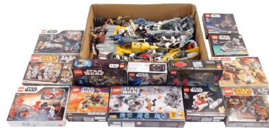
Lego Star Wars, boxed and made up, unchecked. (a quantity) SOLD for £190