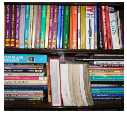
Various Haynes manuals, including Ford Escort 80-90., Vauxhall Carlton 78-86., Ford Cortina., Vauxhall Cavalier., Land Rover parts catalogues., together with books relating to classic cars and motorcycles. (2 shelves) SOLD for £190