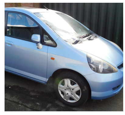
A Honda Jazz SE CVT, Registration SC04 JNV, 5 door hatchback, petrol, 1339cc, blue, first registered 01/07/2004, V5 present, 58,399 recorded miles. To be sold upon the instructions of the Executors of Ellen Edith Wood (Dec'd). SOLD for £1,000