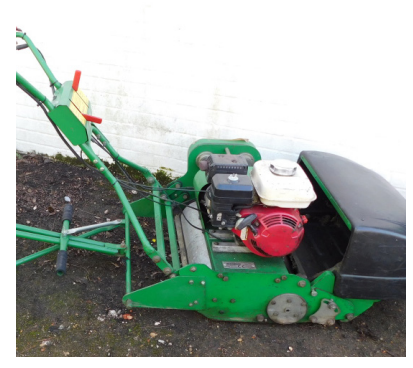
A Dennis Simplex ride-on lawnmower, model no 0510, c2007, serial no 0510 108, manual and other paperwork. SOLD for £400