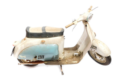
A 1961 Agrati-Garelli 80cc Capri scooter, Registration TTL 496, frame no 7 02759, engine no 1294, 2892 recorded mileage, with original R.F. 60 registration book, no V5 present. (AF) To be sold upon the instructions of the Executors of Kathleen Wright (Dec'd). SOLD for £1,400