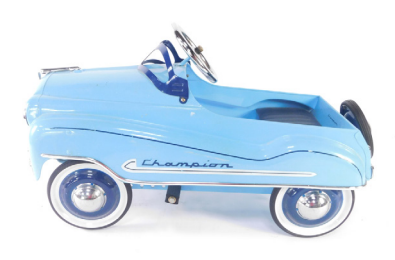
A vintage 'Champion' painted steel pedal car, 100cm long. SOLD for £220