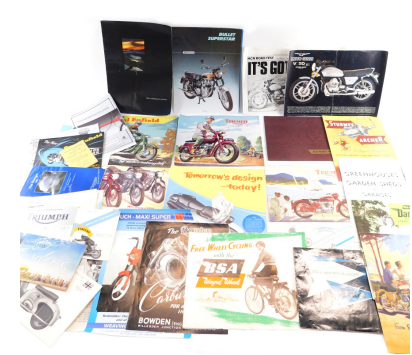
Motorcycle brochures and engine leaflets, including Royal Enfield, Triumph, BSA, and the Motorcycle Buyer's Guide 1957. (a quantity) SOLD for £260