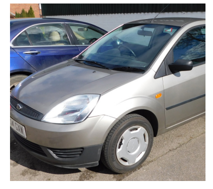
A Ford Fiesta Finesse, Registration FV04 GXW, three door hatchback, petrol, 1242cc, silver, first registered 21/07/2004, V5 present, 37,531 recorded miles. To be sold upon the instructions of the Executors of Charles Potter (Dec'd). SOLD for £1,300