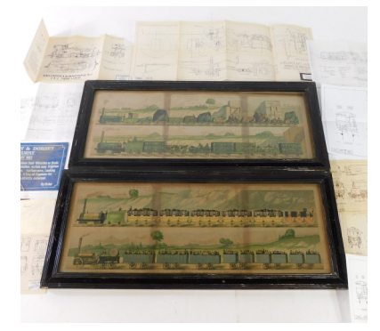
A pair of 19thC prints, Travelling on The Liverpool and Manchester Railway 1831, plates I-IV., published by M B Cotsworth, York., 23cm high, 67cm wide., together with a folder containing scale drawings and plans for scratch built locomotives. (3) SOLD for £100