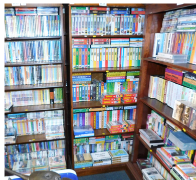
Railway videos and DVDs, to include British Steam, Locomotives, carriages, wagons, etc (3 bookcases) SOLD for £700