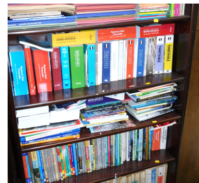
Railway books and timetables, British Rail and National Rail, Ian Allen Rail Centres, including Derby, Peterborough, York and Edinburgh., British Railways Past and Present, etc. (6 shelves) SOLD for £260