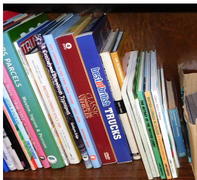
A group of lorry books, to include Century of Petroleum Transport, AEC Lorries, Road Tankers, BRS, lorry related articles and pictures, Classic Commercials, lorry booklets, etc. (4 boxes) SOLD for £100