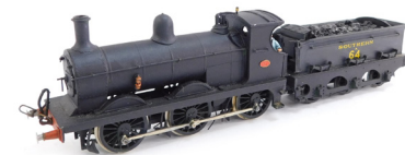
A kit built OO gauge Class 02 locomotive 'E208', Southern black livery, 0-6-0. SOLD for £110