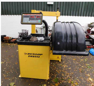
A Dunlop wheel balancer. SOLD for £320