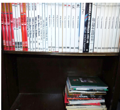
A group of Automobile Year and other Automobilia books, Rally Course annuals, etc. (1½ shelves) SOLD for £360