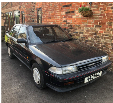
A 1991 Toyota Carina Windsor XL, registration H49 HND, 1.6 litre, petrol, four door saloon, 98,842 recorded miles, MOT to 30th September 2022. To be sold upon instructions from the Executors of Mrs Freda Young (Dec'd) who owned the car since 2013. SOLD for £1,500