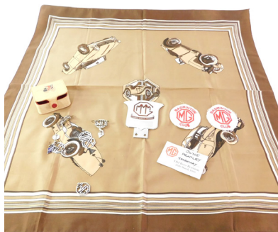
A group of MG collectables, to include two Badminton Club material badges, an MG enamel car badge, an MG enamel pin, MG cufflinks, Riley blue enamel cufflinks and an Abingdon MG silk scarf. SOLD for £300