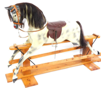
A Haddon Rockers rocking horse, the dappled horse with a maroon leather seat, on a pine base with Haddon Rockers plaque, 116cm high, 150cm wide, 62cm deep. SOLD for £380