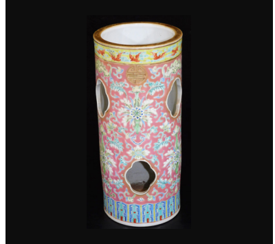
A 20thC Chinese porcelain spill vase of cylindrical form, pierced with shaped cutouts, decorated with scrolling floral design and long life characters on a pink ground with bat and lappet boxers, Six character Qianlong mark in red to the base. 28cm H.