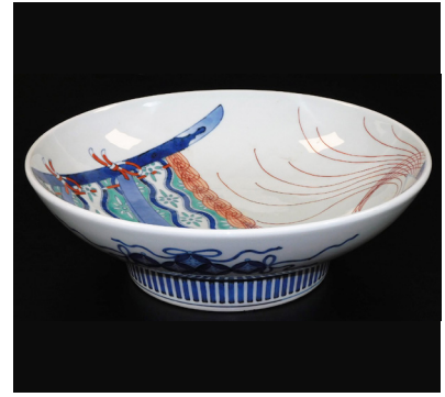
A large Japanese Nabeshima dish, decorated with a hanging textiles and a tassel in red, green and underglaze blue, the reverse with tasselled cash designs above a comb foot, 31.2cm Dia. SOLD for £550