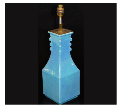
A Chinese turquoise porcelain crackle glazed vase, of square section, converted to a lamp, 49cm H. SOLD for £400