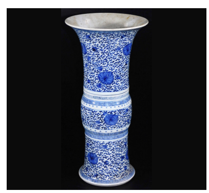
A Chinese porcelain blue and white beaker vase, with flared base and neck, decorated with scrolling lotus designs in underglaze blue, between Greek key fret, scroll and dot bands, glazed base with double ring and two character mark, 19thC, 45cm H. SOLD for £3,250