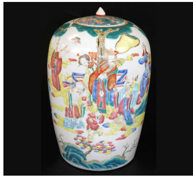
A Chinese porcelain ovoid jar and cover, decorated with a scene of deities and their attendants, in bright enamel colours, unmarked, 32cm H.