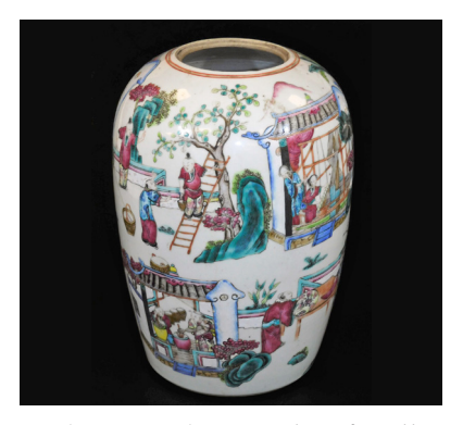
A Chinese 19thC porcelain famille rose vase, of shouldered form, profusely decorated with figures, scholars, etc. to include a man climbing a ladder picking fruit, a pagoda scene, various others, etc.