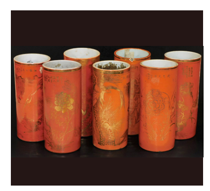
Seven various Chinese porcelain spill vases brush pots, of cylindrical form in orange with gilt highlights showing flowers and calligraphy, etc. 27cm H, some marked. (7) SOLD for £380