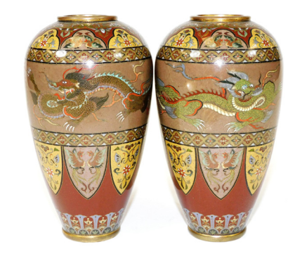
A fine pair of Meiji period Japanese cloisonne enamel vases, decorated with bands of four clawed dragons and shield panels of stylized flowers and phoenixes, predominately in orange, blue, green and yellow, unmarked, 16cm H.