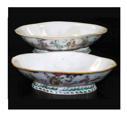
A 19thC Chinese porcelain lobed dish, decorated with mythical figures in flowing robes before fence, predominantly enamelled in orange, green and blue, on a shaped foot with water and wave border, 27cm W and another similar with red seal mark beneath, 19th century. SOLD for £480