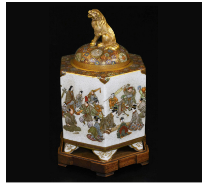
A Japanese Meiji period hexagonal Satsuma koro and cover, with shishi finial, profusely decorated with a continuous scene of figures in flowing robes, beneath mulitfloral band on shaped feet with gilt highlights, signed Kinkozan zo, on wooden stand, 19cm H. SOLD for £2,350