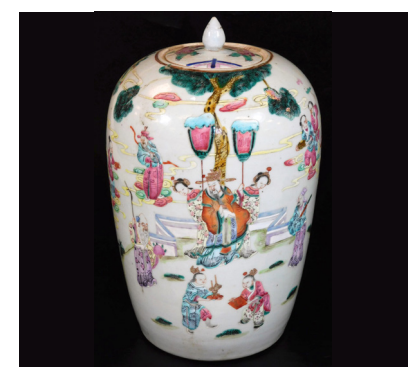
A Chinese porcelain ovoid jar and associated cover, decorated in famille rose palette with figures in flowing robes, phoenix and further flowers, unmarked, 37cm H. SOLD for £600