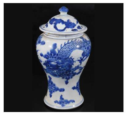
An 19thC Chinese blue and white baluster vase and cover, decorated with four claw celestial dragons (much damage around the rim), 32cm H. SOLD for £750