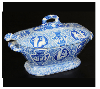
A good blue and white pottery tureen, cover and ladle, decorated with classical figures on a floral ground, c1815, 18cm W. SOLD for £