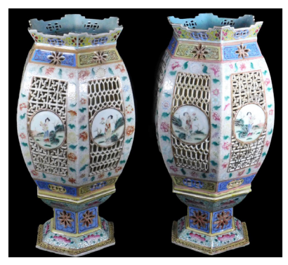
A fine pair of Chinese reticulated porcelain table lanterns, each of octagonal globular form, the bodies partially pierced and set with hand painted panels of figures in exterior settings, 35cm H. (2)