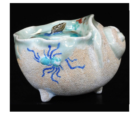
An 18thC Japanese Arita shell shaped koro and cover, the stippled body in the form of a conch with various molluscs attached, on three stub feet, the cover pierced and mounted with a knop shaped as another shell, with wood box, 8.4cm long.