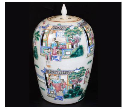
A Chinese porcelain ovoid jar and cover, decorated with figures in a variety of interior settings predominantly in pink, blue and green. unmarked, 32cm H. SOLD for £850