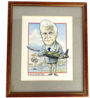
Ken Aitken. Sir Barnes Wallis, colour cartoon caricature, signed, 20cm x 150cm, labelled verso for The Guild Of Aviation Artists, noting its inclusion in the 1995 exhibition. SOLD for £340