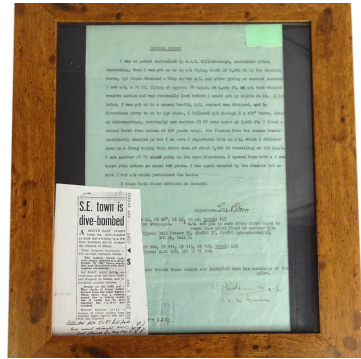
A Guy Gibson signed general report, relating to the South East Coast German Bomber Incendiary Attack of 21st October 1941, 29cm x 19cm, together with reproduction newspaper clipping. SOLD for £1,750