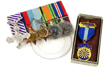
A WWII D.F.C. medal group, Royal Air Force Volunteer Reserve, no. 57 Squadron, to include a 1944 Distinguished Flying Cross, a 1939-45 Star, the Air Crew Europe Star medal, the Defence medal, and the 1939-45 medal. Round Table Past Chairman Boston 337 medal SOLD for £1,050