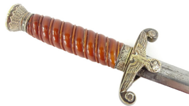
A German Third Reich Army Officers dagger, 1935 pattern, the blade stamped for Gebruder Heller and with balloon man emblem, with a plated scabbard, eagle and swastika guard and Bakelite handle, 40cm long. SOLD for £260