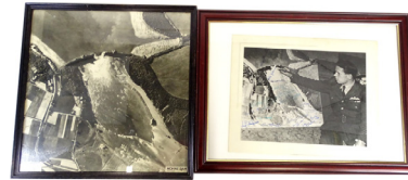
A photograph of Guy Gibson about to sign a chart for The Mohne Dam Raid, with many signatures. 28cm X 38cm and a photographic print of The Mohne Ram and signatures. (2) SOLD for £800