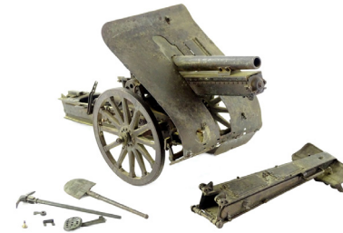
A model of a First World War cannon, cast in iron and with other alloys, an accurate model with various adjustments, etc., engraved Bochumer Verein, possibly incomplete, 42cm long overall. SOLD for £220