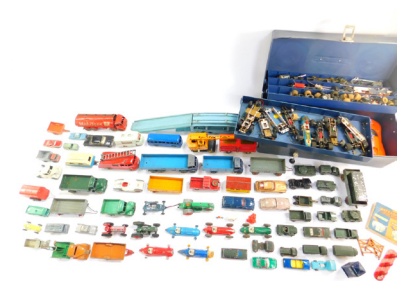
Dinky and other die cast vintage lorries, trucks, cars, military vehicles, etc., playworn, together with a kit box of Scalextric part cars. (1 box plus) SOLD for £280