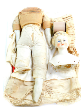
A late 19th/early 20thC bisque headed doll, number 24, modelled with closed mouth, blue glass eyes and hair, with a blue hair band, straw filled fabric body, with bisque legs and arms, approx 61cm high. (AF) SOLD for £190