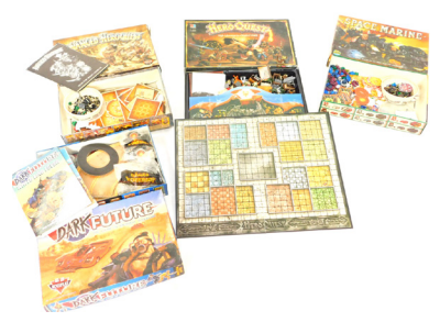
Four Games Workshop Fantasy games, comprising Space Marine., Hero Quest., Advanced Hero Quest., and Dark Future, all boxed. (4) SOLD for £190