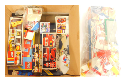
A Lego building set 050, Shell petrol station 325, Beach House 1484, Bus 313, Moonstation 1593 and further lego, boxed and unboxed. (1 box) SOLD for £280