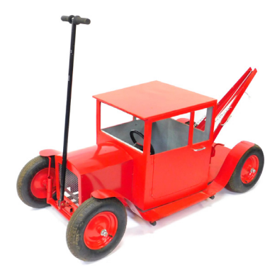
A red model tow truck, plywood and fabricated metal bodied, 180cm long. SOLD for £240