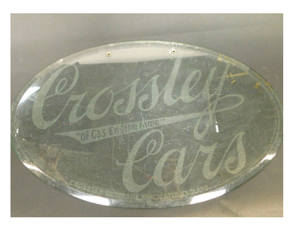
A vintage etched glass motoring sign, marked for Crossley Cars of Gas Engine Fame, 38cm x 61cm oval. SOLD for £220