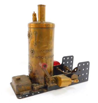
A Meccano early 20thC vertical steam boiler. SOLD for £200