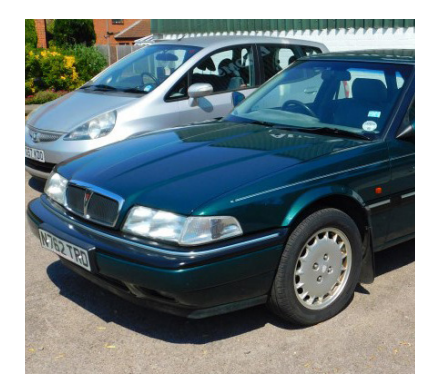
A Rover Sterling, 4 door saloon, 2675cc, petrol, in green, registration number N762 TRD, approx 74,000 miles, first registered 20th September 1995, 1 former keeper, last MOT expired 23rd June 2013, sold with V5 and Rover owner's information manual. SOLD for £1,400