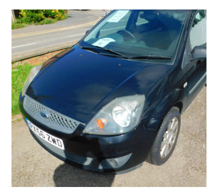
A Ford Fiesta Zetec Climate TDCI, registration PX56 ZWD, 2006, with 5 previous owners, 1.4L diesel, black, approx 122,771 miles, with MOT history, current MOT valid until 15th January 2021, sold with V5 document, no service history, but receipts for works, low tax, one key. SOLD for £650

A Honda Jazz, registration FG57 KDO, silver, battery flat, last recorded mileage at service on 7/11/2018 69,209 miles, first registered 27th September 2007, 5 door, 1339cc, petrol, last MOT expired 24th November 2019, sold with V5, full service history and Honda Jazz owner's pack. SOLD for £1,050