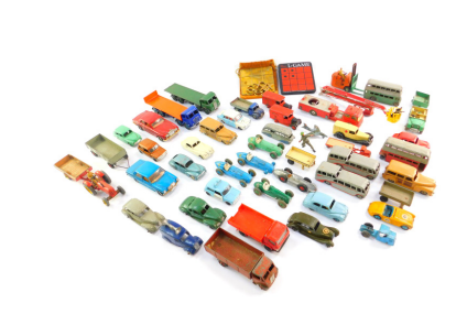
Dinky Corgi and other die cast sports cars, vintage vehicles buses, trucks, etc, play worn, together with a De Bono L game. (1 tray) SOLD for £260