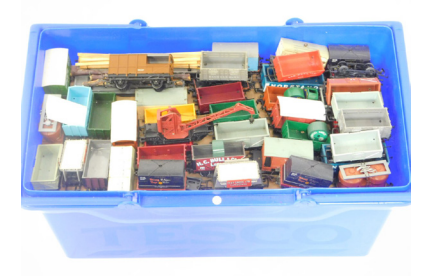
Hornby Tri-ang OO gauge tanker wagons, flat bed trucks, ventilator vans and open wagons. (a quantity). SOLD for £180