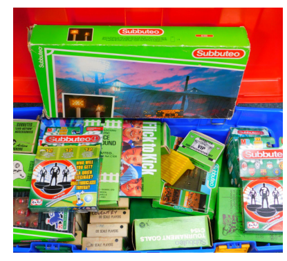
Subbuteo, including flood lights, match score recorder, tournament goals, fence surrounds, teams, together with empty team boxes. (a quantity) SOLD for £500