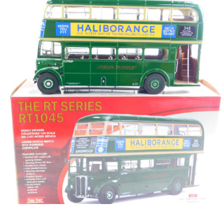
A Sun Star model of an RT Series 1045 double decker bus 1948, JXN73, scale 1:24, boxed. SOLD for £180