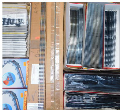
Hornby and other OO-gauge railway and other equipment, track , including R61R/H points, some boxed. (a quantity) SOLD for £200