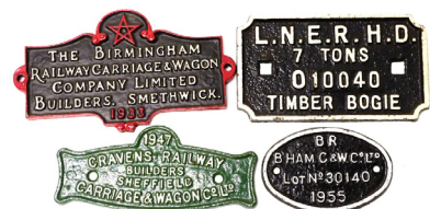
A cast iron railway sign , LNER HD7 tonnes 01040 Timber Bogie 26cm wide, and the Birmingham Railway Carriage and Wagon Company Limited Builders Smethwick 1933 and two other. (4) SOLD for £130