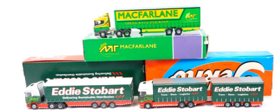
Die cast 1:50 scale advertising lorries , Tekno Eddie Stobart, Corgi Renault Macfarlane, etc., boxed. (3) SOLD for £180