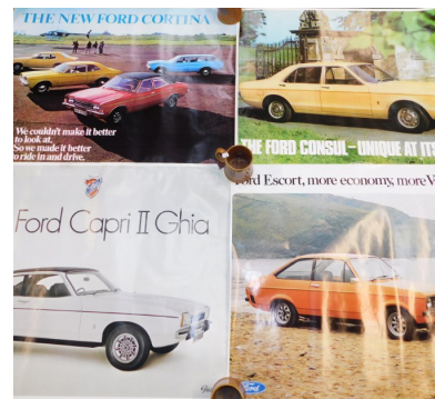
Twenty six 1970's Ford advertising posters , including The Capri, Escort, Granada, Popular, and Fiesta. SOLD for £340