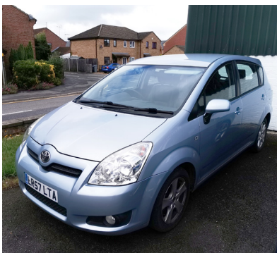
Toyota Corolla Verso VVYI T3 S-A , registration LR57 LTA, petrol. blue, first registered 27092007. SOLD for £600