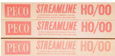
Peco boxed streamline HO/OO-gauge track, SL-100 . (3 boxes) SOLD for £130