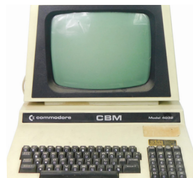
A vintage Commodore CM4032 computer with built in monitor , 43cm high, 43cm wide, 51cm Deep. SOLD for £260