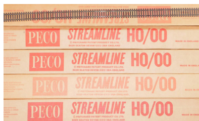
Peco OO/HO gauge streamline track SL100 . (5 boxes) SOLD for £160