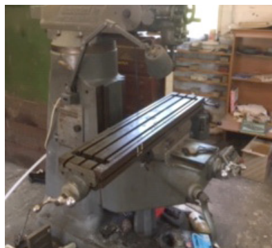
A Bridgeport Turret vertical Milling Machine, Series 1 , Single Phase Conversion, 2HP, with associated cutters, attachments and spares.NB. SOLD for £440