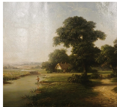
Walter Heath Williams (act.1841-c.1876). River landscape with thatched cottage, figure fishing, oil on canvas, signed, 43cm x 64cm. SOLD for £500