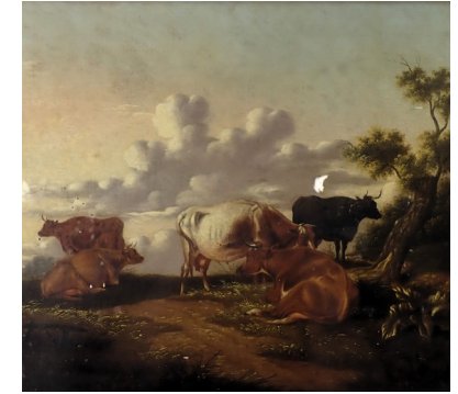
Dutch School (Late 19thC). A wooded rural landscape with cattle, oil on canvas, 29cm x 39cm. Henry Spencer and Sons, Retford 9/4/76 Lot 165 - £110. SOLD for £380