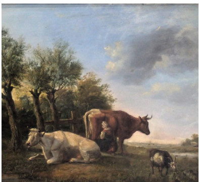
Dutch School (Early 19thC). A woodland landscape with cows and a milkmaid and a goat eating a cabbage in the foreground, further cattle, a stream and a village in the distance, oil on panel, 44cm x 60cm. Henry Specer and Sons, Retford 9/4/76 Lot 226 - £300. SOLD for £440