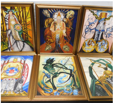
20thC School. A set of six oil on canvas Thoth Tarot cards After Lady Frieda Harris as commissioned by Aleister Crowley for Tarot Deck, 60cm x 44cm. Label verso CCA Galleries, Oxford. SOLD for £420