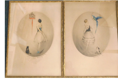
Louis Justin Laurent Icart (1888-1950). Blue Parrot, Red Cage, two artist signed coloured etchings, 46cm x 32cm. (2) SOLD for £340