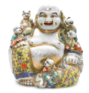
A 20thC Chinese porcelain figure of a happy Buddha, modelled seated with five children, bears paper label, 20cm high. SOLD for £100