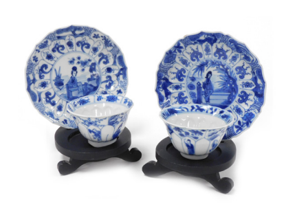
A pair of Kangxi porcelain blue and white tea bowls and saucers, of moulded floral form, decorated with figures beneath blossom and dragons, internally with a four claw dragon and panels of flowers, with stands.