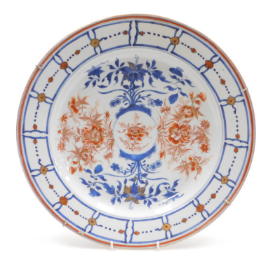
A Kangxi porcelain Imari charger, painted with flowers, within a panelled and flower head border, verso floral sprigs, 39cm wide. SOLD for £190