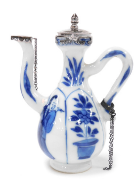
A Kangxi blue and white porcelain export ewer, of fluted, pear form, decorated with panels of ladies, and pots of flowers, with white metal lid and mount to spout, single character mark, 10cm high.