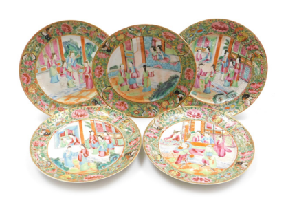
Five 19thC Cantonese famille rose porcelain plates, decorated with figural scenes, within a border of fruit, butterflies and flowers on a gilt ground, 20cm wide. SOLD for £190