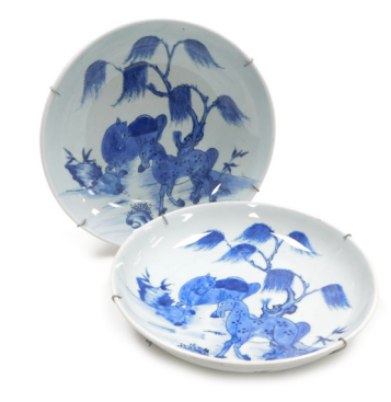
A pair of Qing dynasty blue and white porcelain dishes, decorated with two horses and a tree, verso sprigs of bamboo, 28cm wide. SOLD for £1,100