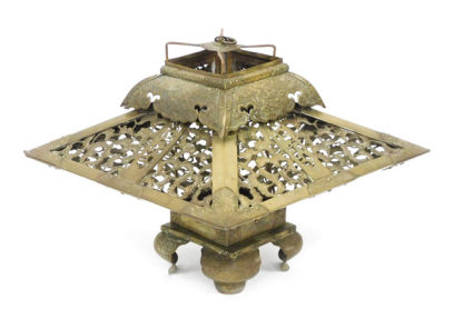
A Meiji period Japanese brass lantern, of compressed, square form, with pierced and engraved floral decoration, raised on four scroll feet, 34cm high, 42.5cm wide. SOLD for £130