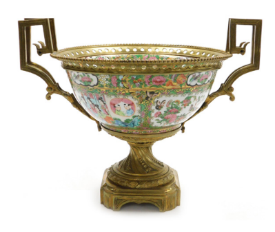
A 19thC Cantonese famille rose porcelain and ormolu mounted bowl, with a beaded and pierced mount and angular scroll handles, the bowl decorated with reserves of figures, and birds, butterflies and flowers, within a gilt ground decorated with fruit, flowers and insects, raised on a fluted stem with laurel wreath, above a canted square bracket feet base, 31cm high, 39cm wide.