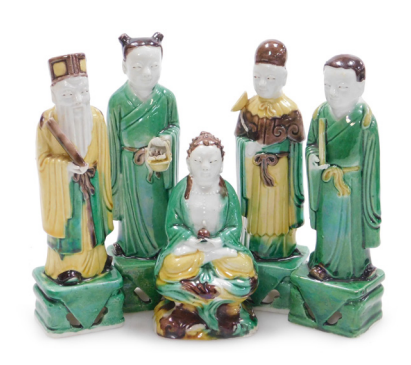
Five Qing dynasty sancai glazed figures, of a seated Buddha, 11cm high, and standing court officials on rectangular bases, 14.5cm high. SOLD for £140