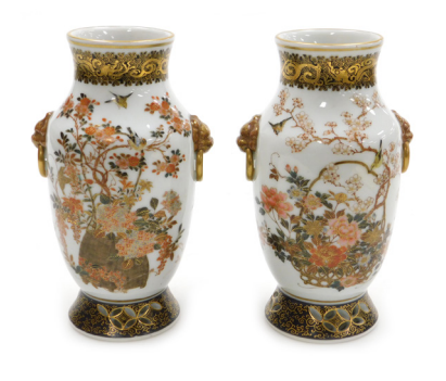
A pair of Taisho period Japanese porcelain vases, with lion's head and ring handles, decorated with birds and baskets of flowers, above a pierced circular foot, three character mark, 22cm high. SOLD for £130