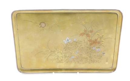
A Meiji period hirazogan bronze tray, inlaid in gold, silver and copper with flowers and grasses under a full moon and clouds, raised on four bracket feet, signed, 22.5cm wide. SOLD for £750