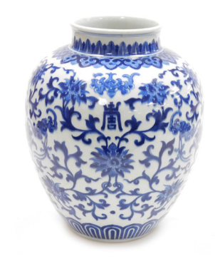
A Qing dynasty blue and white porcelain vase, decorated with scrolling lotus, long life symbols and bats within lappet borders, 32cm high.