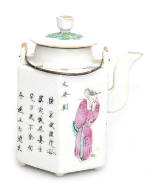
A Tongzhi famille rose porcelain teapot, of hexagonal form, decorated with panels of Immortals, and script, with a metal carrying handle, 12cm high. SOLD for £120