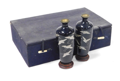
A pair of Japanese Meiji period silver wire cloisonne vases, on stands, of shouldered tapering form, decorated with birds on a dark blue ground, 15cm high. SOLD for £155