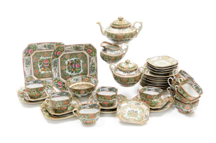
A 20thC Cantonese famille rose porcelain tea service, decorated with birds, butterflies and flowers, printed red China mark, comprising; teapot, sucrier, cream jug, sugar or slop bowl, pair of bread plates, eleven tea cups, nine saucers, and twelve tea plates. SOLD for £190