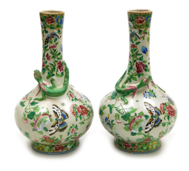
A pair of late 19thC Qing dynasty Cantonese famille rose pottery vases, of long necked bulbous form, moulded with chilin (baby dragons) and decorated with butterflies and flowers, 29cm high. SOLD for £160