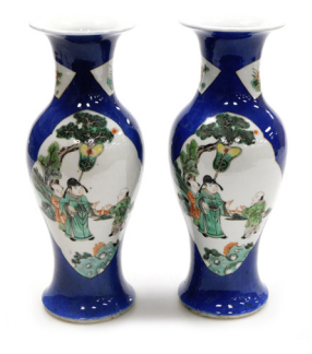
A pair of late 19thC Chinese blue ground porcelain vases, of baluster form, decorated with reserves of figures, blossom, and flowers, four character Kangxi mark, 25cm high. SOLD for £400