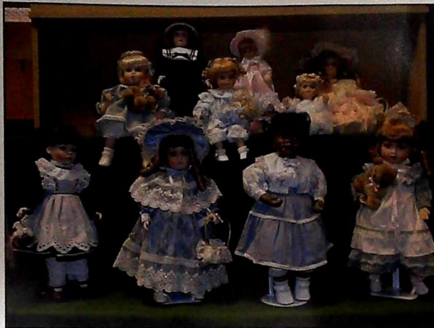
Collection of Modern Dolls