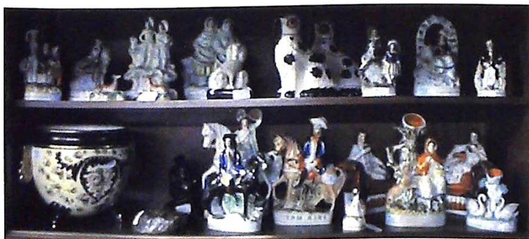
Collection of Staffordshire