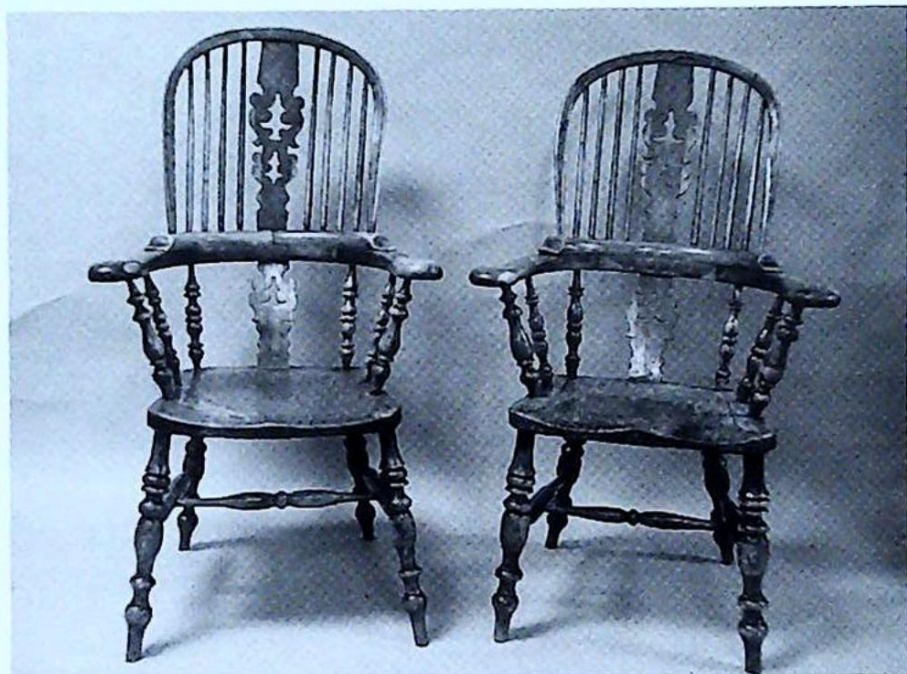
A pair of Georgian yew Windsor Chairs Sold in our last sale for