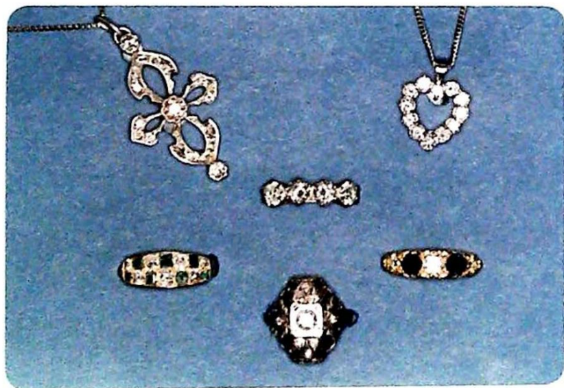
Left to right, Top, Lots 35, 131 and 91. Bottom, Lots 17, 34 and 82.