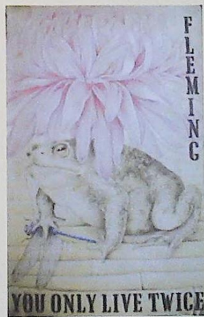
From a selection of Ian Fleming 1st editions.