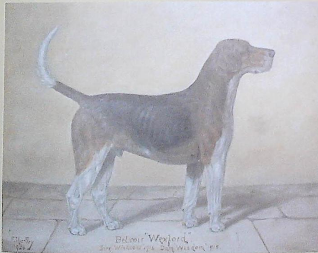
One of 5 works by Fred Thurlby in the sale