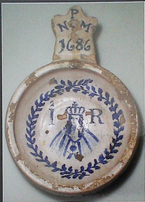
A slip-glaze porringer or bleeding bowl, dated 1686.

Included in our Important two-day Autumn Catalogue Sale