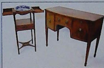
LOT 971 & 985