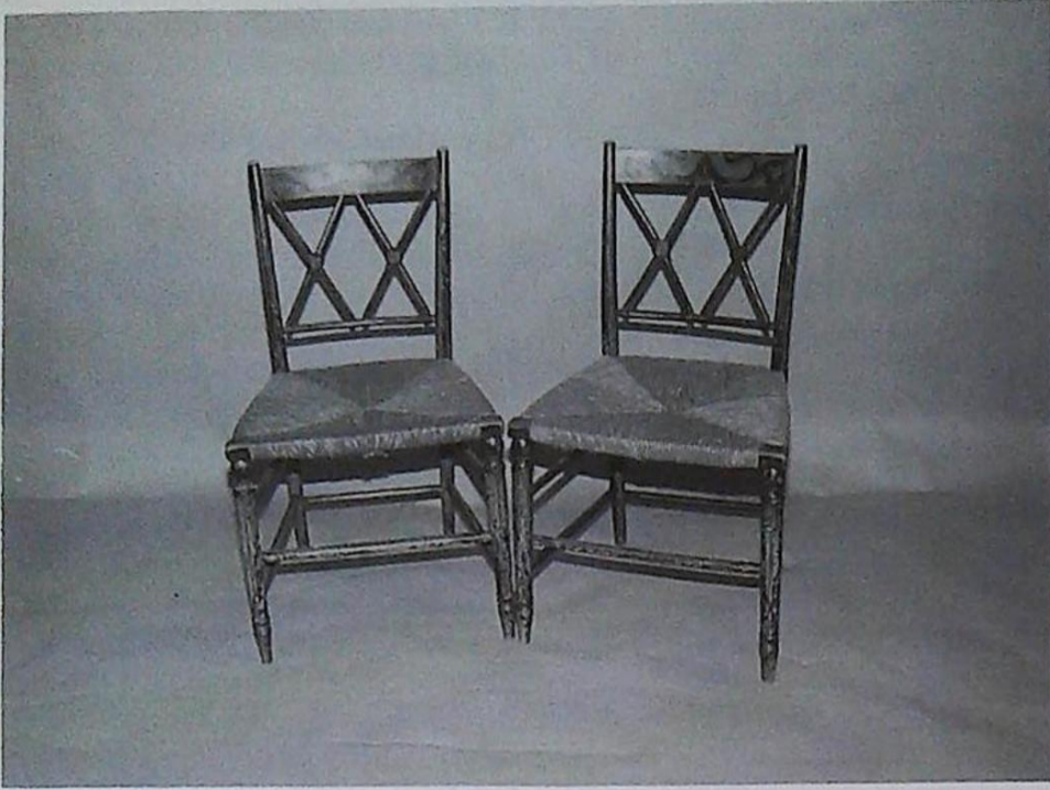
Selection of items from Lots 660 - 700