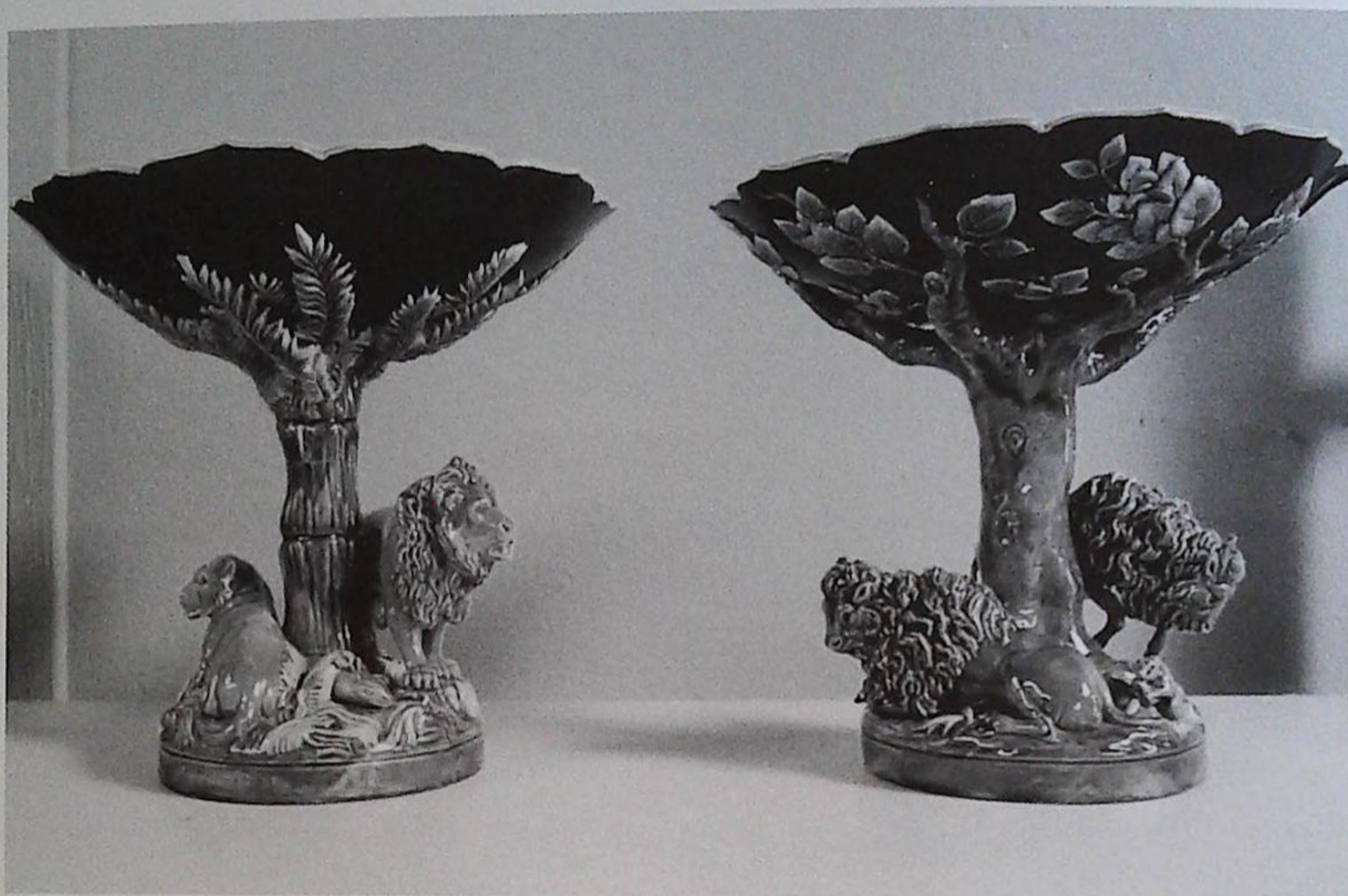
Two George Jones Majolica Centers - Sold for £17,000