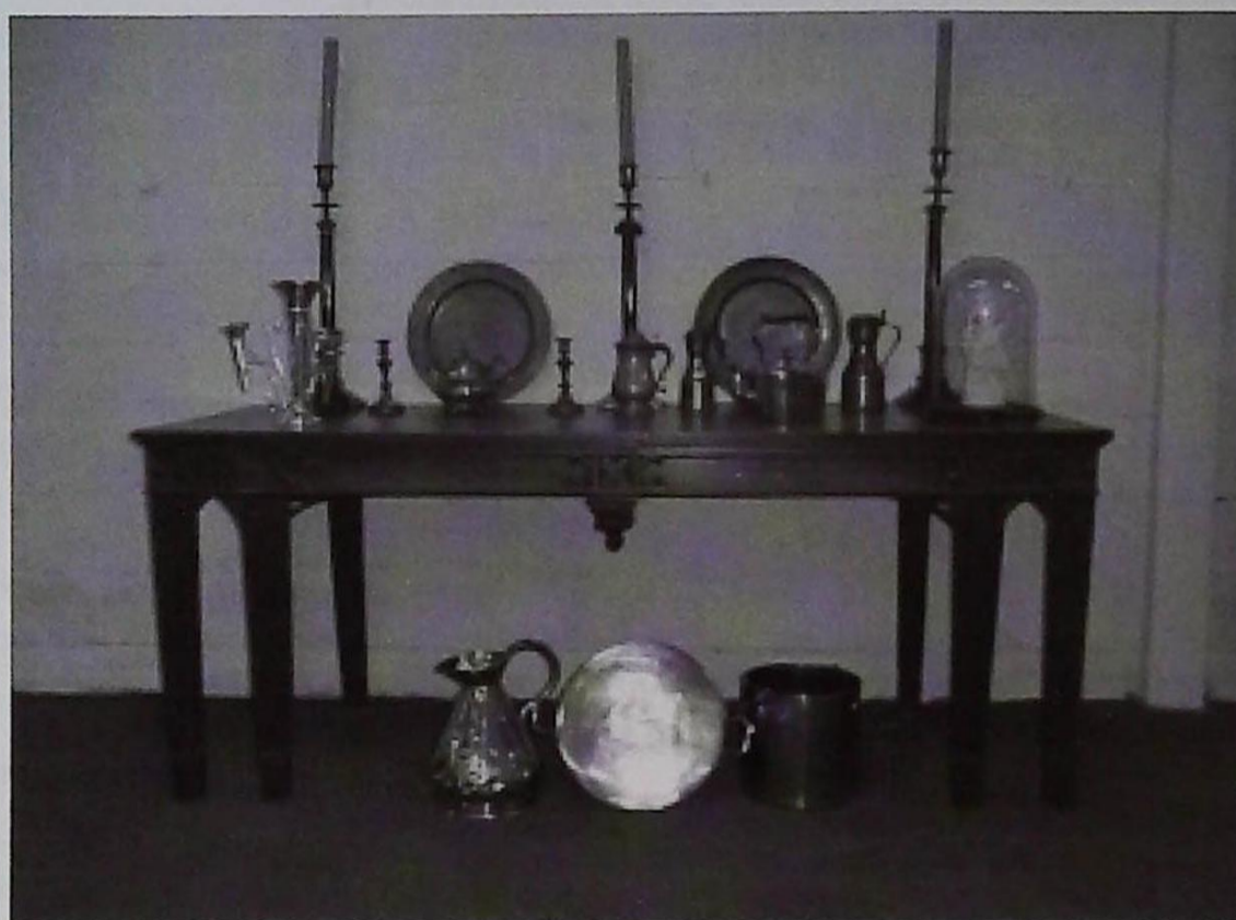
Cover Illustrations Lots 479 & 480 — Frontispiece Illustration Lot 790

On Wednesday 20th October, 1999 at 10 a.m.